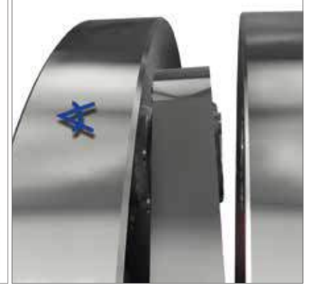
Angular misalignment of max. 3°