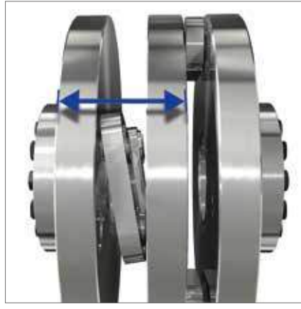
Axial equalisation up to 40 mm

max. 3°, a radial shaft misalignment up to 100 mm and an axial equalisation up to 40 mm.